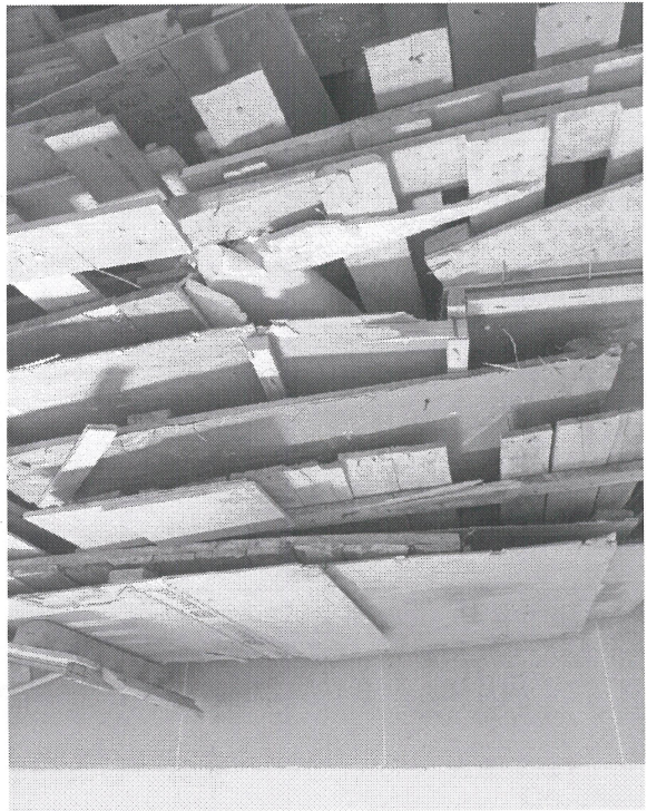
1) Wooden Scrap